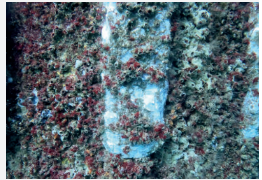
Biofouling developing on a galvanic anode